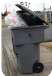
Extra will be charged.