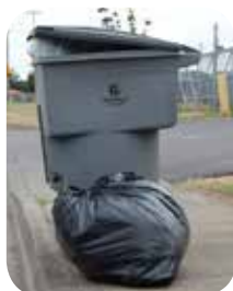
Extra will be charged - extra trash is bagged.