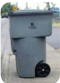
OK (no extras)

Please place loose items in bags or boxes. We charge for extra trash if the cart is over-full and the lid cannot close.