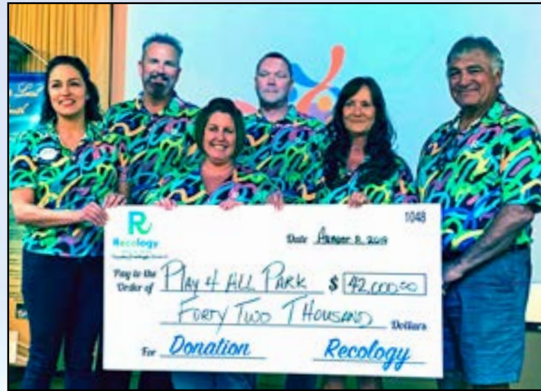
The Recology Golf Committee presents a check for $42,000 for the Play 4 All Park that is being built in Vacaville. The funds were raised during the annual Recology Golf Tournament that was held in June.

Fall is here and the leaves are changing with the season. Recology offers three options for extra yardwaste collection. The first option is to rent additional yardwaste Toters® from Recology . The second option is to use your own sturdy 32-gallon cans that have handles and tight fitting lids. The third option is to use twine to tie tree or shrub prunings into bundles that are no larger than 3 feet by 2 feet. There is no extra charge for bundles or extra cans. Place either beside your green Toter®. Your green Toter® must be set out to use Extra Yardwaste services.