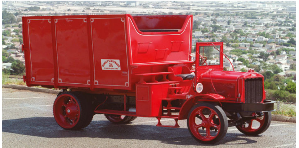
The classic truck, Big Red, was the kind used by trash collection workers in Recology's early days.

While the physicality of collection has changed over the course of the past century, Recology employee-owners still spend their days navigating the narrow alleyways and busy loading docks of San Francisco. Our work connects us to the distinct neighborhoods we serve and has provided a unique